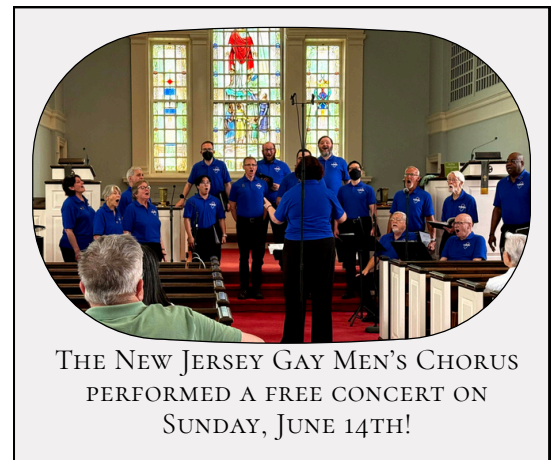
THE NEW JERSEY GAY MEN'S CHORUS PERFORMED A FREE CONCERT ON SUNDAY, JUNE 14TH!