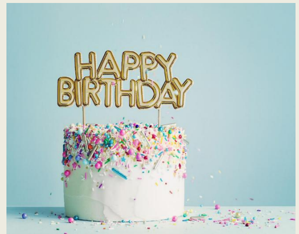
Many warm wishes for another year filled with joy, laughter, and sweet blessings!